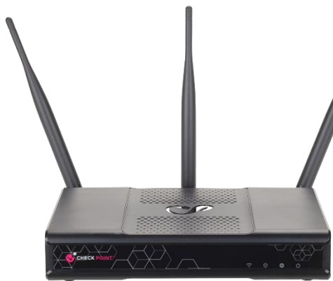
1535 and 1555 Pro Wi-Fi