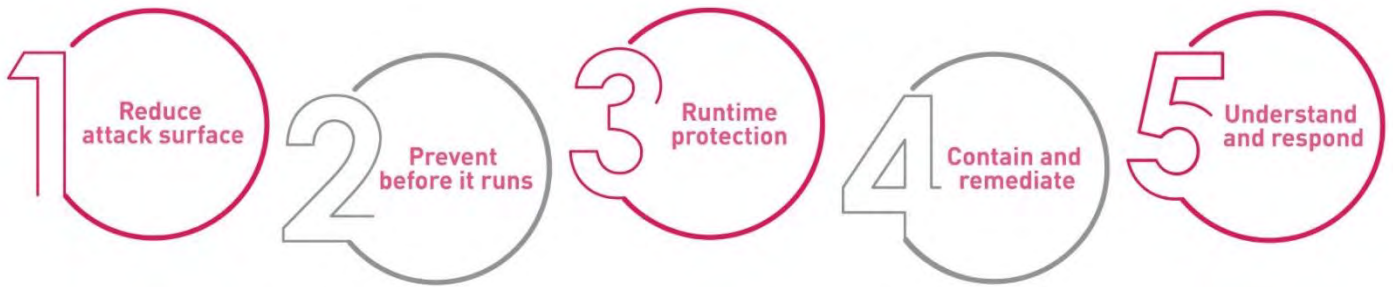
Figure 1. Five best practices to elevate endpoint security

The graphic below identifies five principles you should apply when building strong endpoint security.