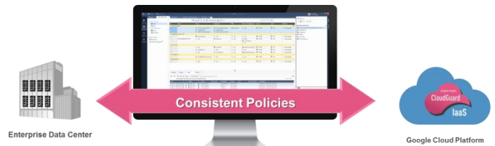
The Check Point Smart Dashboard provides real-time visibility into activity that spans the data center to the Google public cloud

Policy management is simplified with centralized configuration and monitoring of cloud and on-premises security from a single console. This ensures that the right level of protection is applied consistently across both hybrid cloud and physical networks. Hybrid cloud workload traffic is logged and can be easily viewed within the same dashboard as other logs.