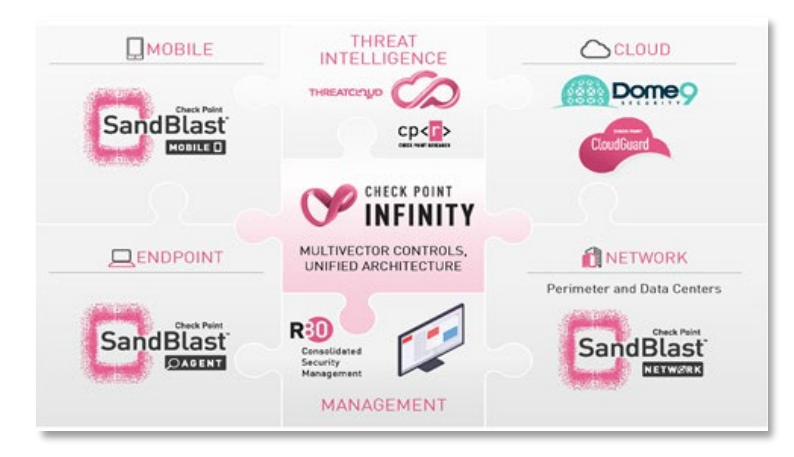
Figure 2: Check Point Infinity – A Consolidated Zero Trust Security Architecture

AUTOMATION AND ORCHESTRATION: Check Point Infinity includes a rich set of APIs that support automated integration with the organization's broader IT environment to enable speed and agility, improved incident response, policy accuracy, and task delegations. These APIs are used by over 160 Check Point's technology partners to develop integrated solutions.