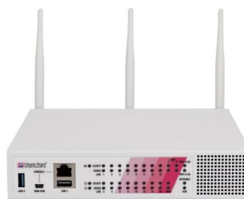
770/790 APPLIANCE (WI-FI OPTION)