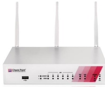
730/750 APPLIANCE (WI-FI OPTION)

RELIABLE SECURITY, UNCOMPROMISING PERFORMANCE