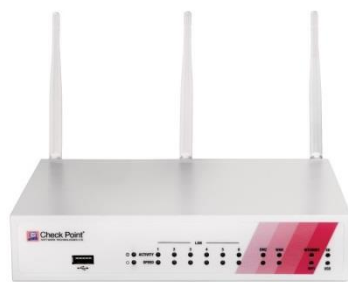
730/750 APPLIANCE (WI-FI OPTION)

RELIABLE SECURITY, UNCOMPROMISING PERFORMANCE