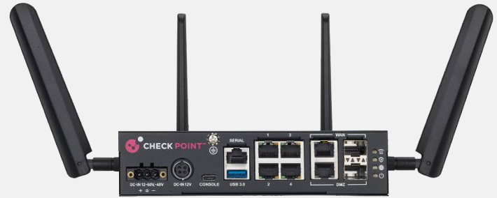
1595R 5G & 1575R (WiFi/LTE)

Check Point Quantum Rugged appliances ensure industrial sites, manufacturing floors and mobile fleets are connected and secure. The solid-state design of the Quantum Rugged security gateways operates in temperatures ranging from -40°C to 75°C, making it ideal for securing any industrial application—power and manufacturing plants, oil and gas facilities, maritime fleets, building management systems, and more. Connect your field devices to the Rugged LAN switch and your Rugged gateway to OT management networks via copper and fiber Ethernet ports as well as via integrated Wi-Fi, LTE, and 5G cellular connectivity.