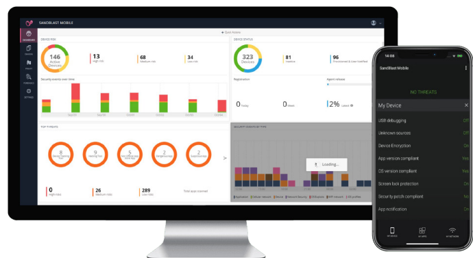
SandBlast Mobile Management Console