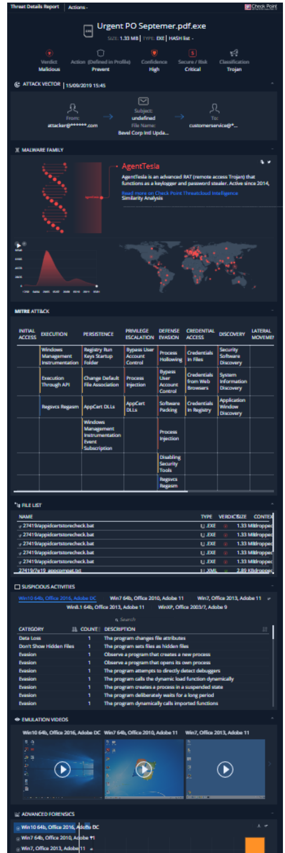
SandBlast Network Threat Emulation Report