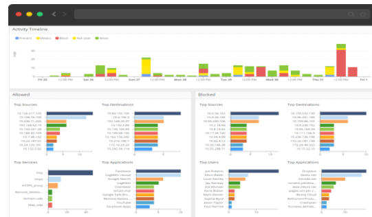
Figure 3: Visual, comprehensive view of your environment

With R80.10, Threat Management is fully integrated, with logging, monitoring, event correlation and reporting in one place. A visual dashboard provides full visibility into security across the network, helping you monitor the status of your enforcement points and stay alert to potential threats.