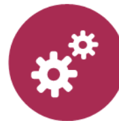
Efficient, Automated Operations