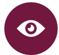
Integrated Threat Management