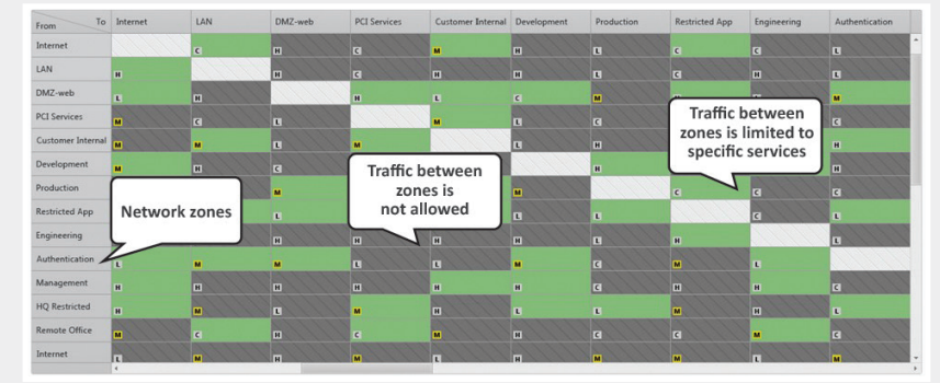
Tufin's Security Zone Matrix -- simplified, centralized baseline to control your network security policy management

Defining and enforcing network segmentation across different vendors and platforms is a major challenge for security teams. Tufin's Unified Security Policy ^{(TM)} helps resolve the challenge by visualizing a security zone matrix that maps zone-to-zone traffic limitations. This central security policy baseline enables identifying violations in real-time across physical networks and hybrid cloud for tighter control and continuous compliance.