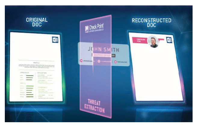
SandBlast Content Disarm & Reconstruction (CDR)

The SandBlast Threat Emulation technology employs the fastest and most accurate sandboxing engine available to pre-screen files, protecting your organization from attackers before they enter your network. Traditional sandbox solutions detect malware behavior at the OS level—after the exploitation has occurred and the hacker code is running. They are therefore susceptible to evasion. SandBlast Threat Emulation capability utilizes a unique CPU-level inspection engine which monitors the instruction flow at the CPU-level to detect exploits attempting to bypass OS security controls, effectively stopping attacks before they have a chance to launch.