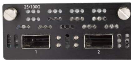
Next Generation Firewall, Next Generation Threat Prevention and Threat Prevention + SandBlast packages

All-inclusive Security Solutions Check Point 16000 security gateways include all security technologies including the SandBlast (sandboxing) software package for one year. Purchase a renewal for NGFW, NGTP or SandBlast (SNBT) for subsequent years as you like.