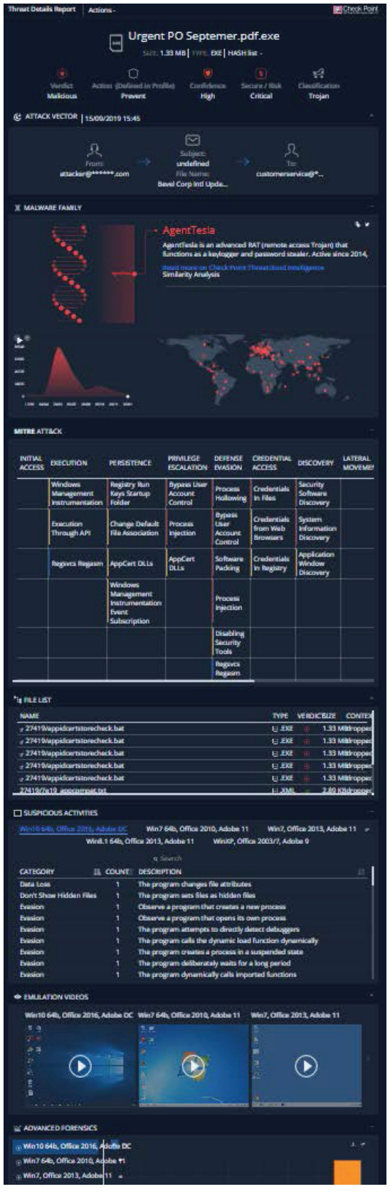
SandBlast Network Threat Emulation Report